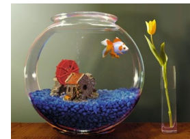
Fish in a 10 Gallon Fish Tank