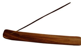
Candles, Incense Burners, Open Flames, Etc.