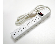
Surge Protectors (Must Have an On/Off Switch!)