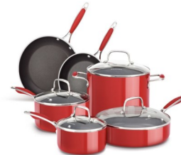
Pots and pans to use in communal kitchen