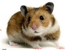
Fish tanks with filters, Hermit Crabs, Hamsters, Etc.