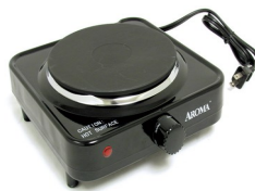
George Forman Grills, Toasters, Hot Plates, Etc.