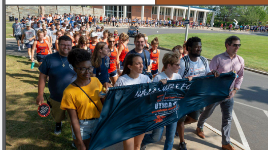
2018 Walk a Mile for Unity (additional photos on page 2 and at facebook.com/uticacollege )