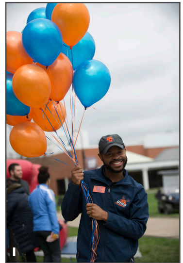
May 2017 7