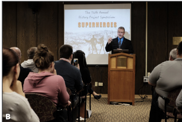
A - B. Seniors in UC's history program presented their research to the community during the annual History Project Symposium. 4/13