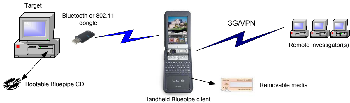
Figure 2. Current prototype implementation with a single client