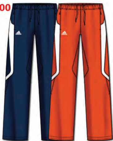
SCORCH SIDELINE PANT

CLIMALITE® knit pant. 31½" inseam. Side-seam pockets with auto-lock zips. 16" auto-lock zip at lower legs. Internal drawcord and elastic waistband. P55452 Na/Wh, P55445 Or/Wh.