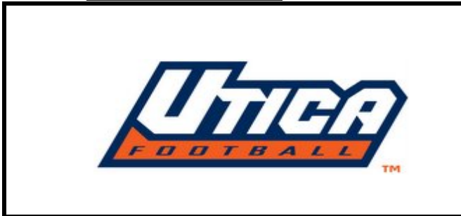
Logo for embroidered goods: