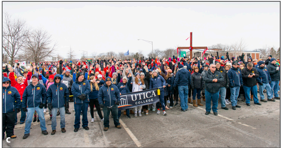
A-C: Team UC was bundled up and ready to brave the elements as Utica College hosted America's Greatest Heart Run and Walk. 3/2