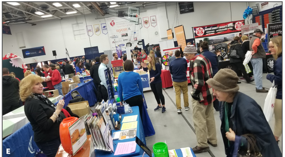
D-E: Utica College hosted the annual Health and Fitness Expo in the Harold T. Clark Jr. Athletic Center. 3/1