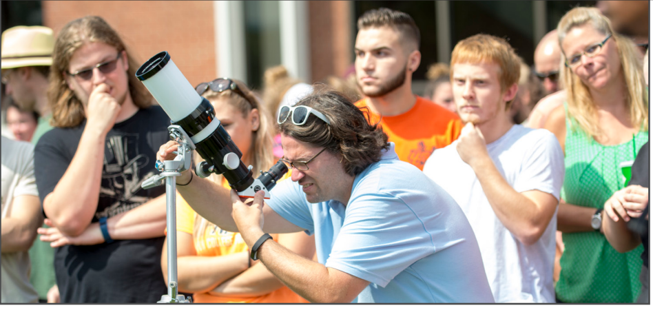
See more pictures from the Solar Eclipse viewing event on page 8