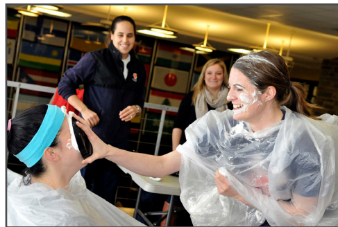
Some familiar faces geared up in plastic bags and goggles to prepare for the "Pie Your Coach" fundraiser to benefit Team UC in America's Greatest Heart Run & Walk. 2/19