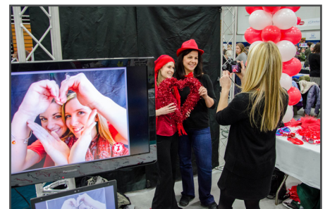
Members of the UC community and the public attended the recent Heart Run & Walk Expo to learn more about heart health. 2/28