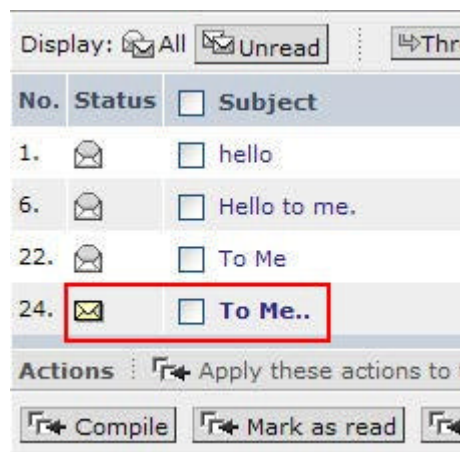
Fig. U 1-2