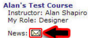
Fig. M 1-1

If you have new mail messages, they will show up under the name of your course as an icon within the myWebCT area. When you click on the icon that looks like an envelope you will be taken directly to the WebCT Email tool. NOTE - Some instructors do not allow you to see this icon and others allow you to see that there is new mail but will not be allowed to click on the envelop icon. (See the tutorial on How to Read your Email messages for information).