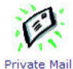
Fig. M 1-2

The Icon Link (go the Icon Link tutorial to learn more about it) usually titled "Email" can be found somewhere within your course. When you click on the Icon Link you will be taken directly to the WebCT Email tool. (See the tutorial on How to Read your Email messages for information).