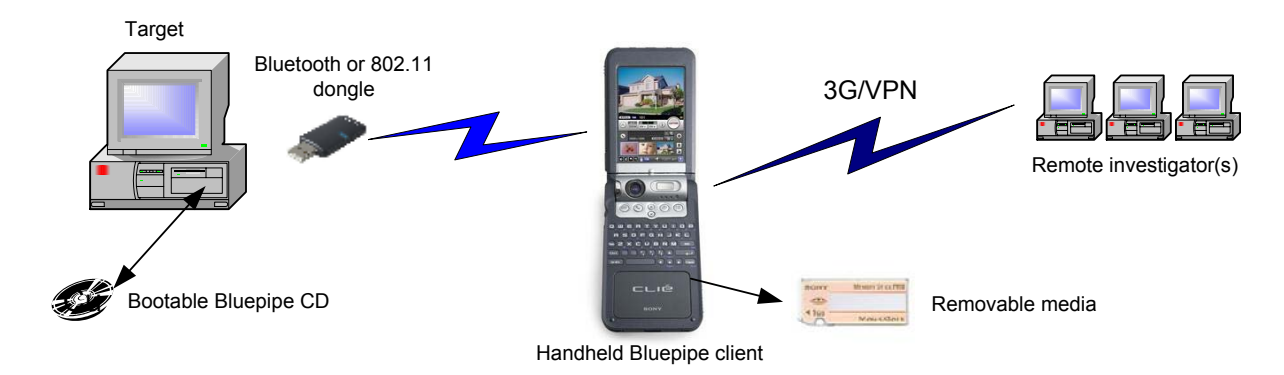
Figure 2. Current prototype implementation with a single client