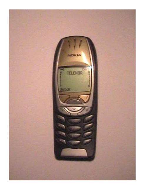
Fig 4 - Mobile Equipment (ME)