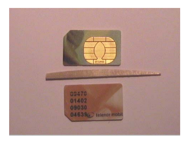
Fig 2 – Subscriber Identity Module (SIM)

GSM provides authentication of users and encryption of the traffic across the air interface. This is accomplished by giving the user and network a shared secret, kalled Ki. This 128-bit number is stored on the SIM-card, and is not directly accessible to the user. Each time the mobile connects to the network, the network authenticates the user by sending a random number (challenge) to the mobile. The SIM then uses an authentication algorithm to compute a authentication token SRES using the random number and Ki. The mobile sends the SRES back to the network which compares the value with an independently computed SRES. At the same time, an encryption key Kc is computed. This key is used for encryption of subsequent traffic across the air interface. Thus, even if an attacker listening to the air traffic could crack the encryption key Kc, the attack would be of little value, since this key changes each time the authentication procedure is performed.